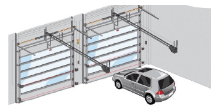
Retail automotive applications are ideal for installing a combination of the SG 5000 high speed roll-up door and the SG 5000 low speed door.