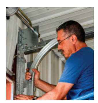
Standard or Hi-Lift 3" Tracks