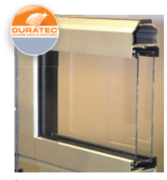
Double-pane insulated windows slats with exclusive Duratec® finish