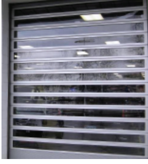
Model SG 5000 LS CV low speed complete view