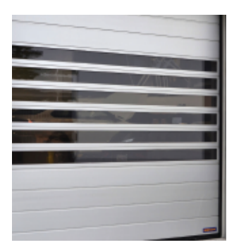
Model SG 5000 LSS with solid panel and select number of vision slats