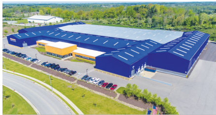
Burgettstown, PA - High Performance Doors

As one of the world's leading manufacturers of doors we're committed to providing the best quality, value, and selection. Whether residential, commercial or industrial, we have the door you're looking for. Each Hörmann product gives you the perfect array of benefits and options to satisfy your customers.