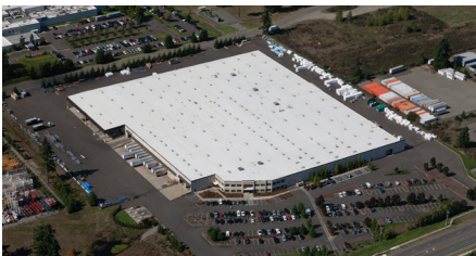
Puyallup, WA - Sectional Doors