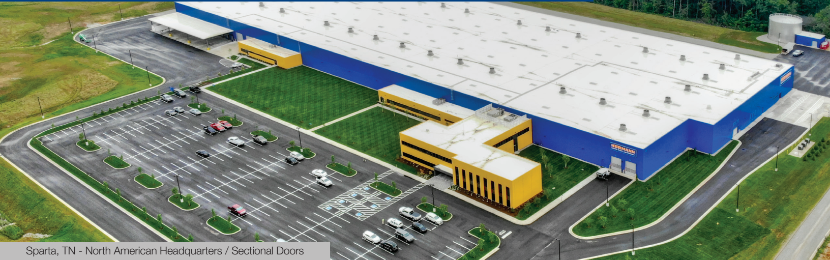
Sparta, TN - North American Headquarters / Sectional Doors