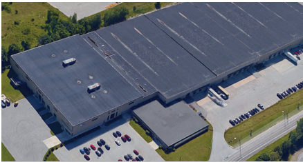
Barrie, ON Canada - High Performance Doors