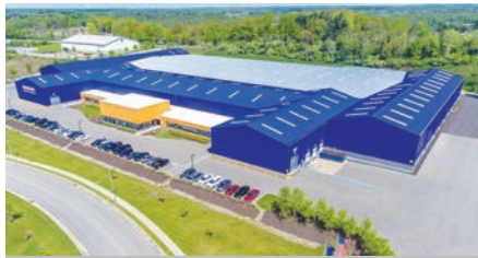
Burgettstown, PA - High Performance Doors

As one of the world's leading manufacturers of doors we're committed to providing the best quality, value, and selection. Whether residential, commercial or industrial, we have the door you're looking for. Each Hörmann product gives you the perfect array of benefits and options to satisfy your customers.