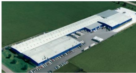
Montgomery, IL - Sectional Doors