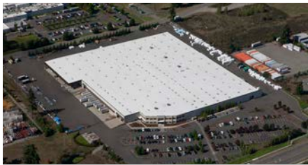
Puyallup, WA - Sectional Doors