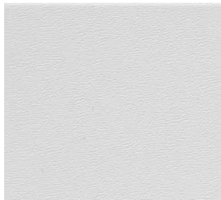
340S, 350S and 354S panels are all available with woodgrain embossment in flush design.