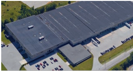
Barrie, ON (CAN) - High Performance Doors