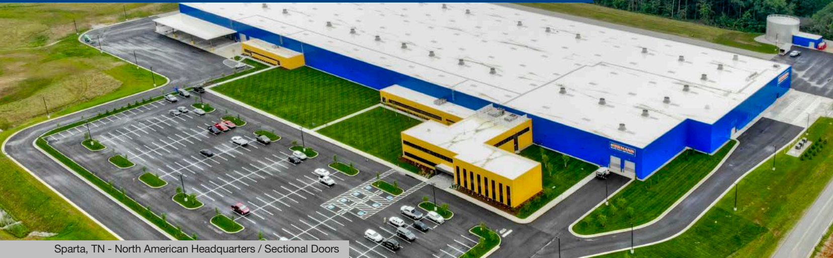
Sparta, TN - North American Headquarters / Sectional Doors