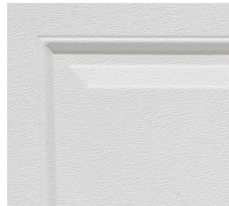
340S and 350S panels are available with woodgrain embossment in short raised panel design in certain configurations.